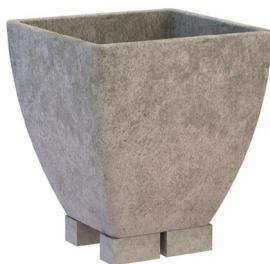
4 Pot Feet needed