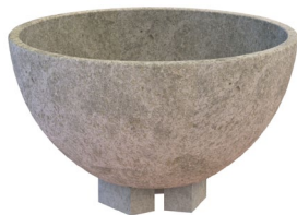
3 Pot Feet needed